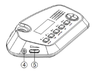
Side view of delegate unit