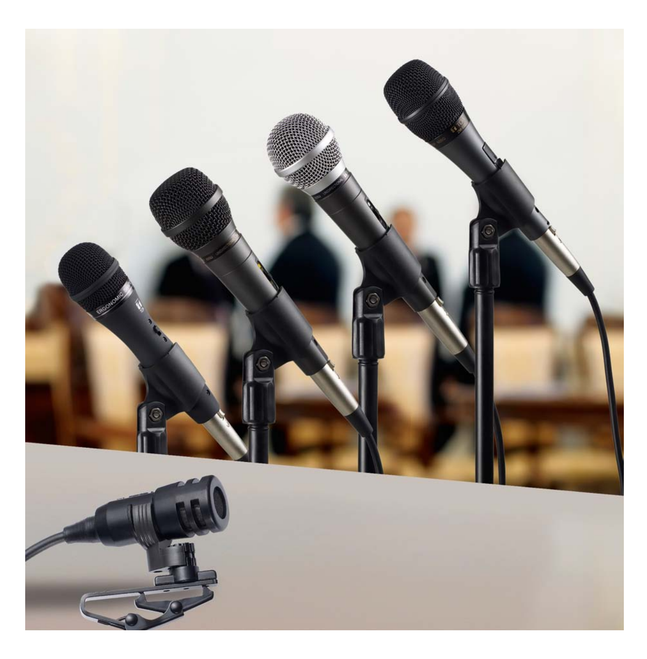
High intelligibility for speech and vocal applications.