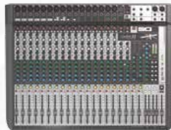
Signature 22 MULTI-TRACK

Soundcraft, Harman International Industries Ltd., Cranborne House, Cranborne Road, Potters Bar, Hertfordshire EN6 3JN, UK T: +44 (0)1707 665000 F: +44 (0)1707 660742 E: soundcraft@harman.com Soundcraft USA, 8500 Balboa Boulevard, Northridge, CA 91329, USA T: +1-818-893-8411 F: +1-818-920-3208 E: soundcraft-usa@harman.com