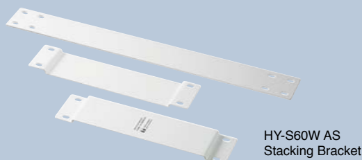
HY-S60W AS Stacking Bracket