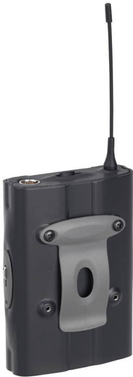
Belt-pack rear view