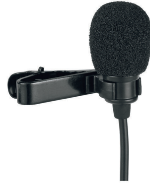
Lavalier microphone with clip