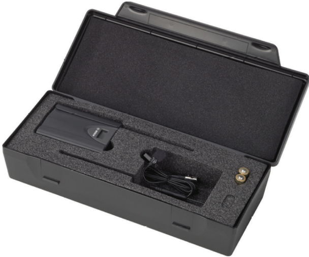
Protective case with wireless, belt-pack and accessories