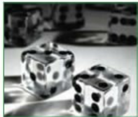
20,000:1 Contrast Ratio